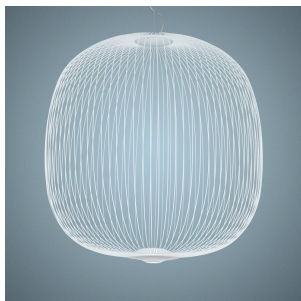
Spokes 2 Large